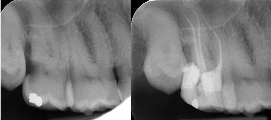
Subgingival caries 17, SDR pre endo restoration and then RCT