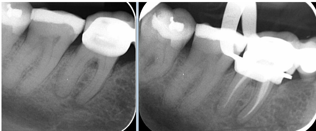
RCT through bridge abutment 46