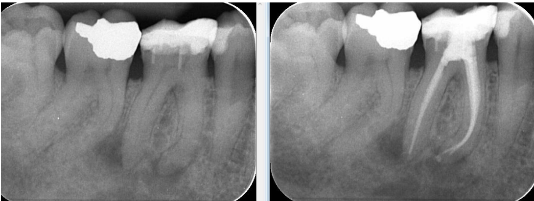
RCT 46 with composite dowel in canal orifices